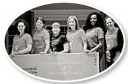
Spring 2014 Newsletter and Resident Retreat Committee