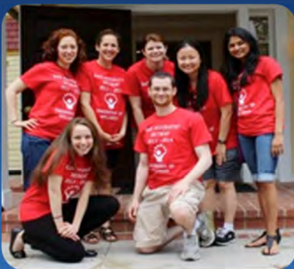
PGY-3s, featuring two of our Global Mental Health ambassadors. Read their stories on page 8.

Please turn to the next page to read some of the fascinating stories our residents have brought back from their global advocacy trips.