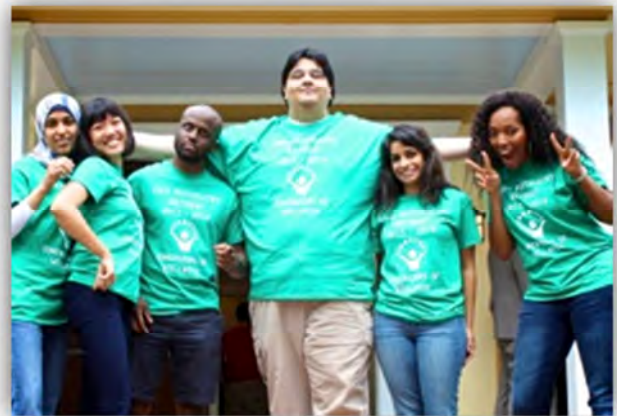
PGY-2s at the Resident Retreat

local settings. To date, it seems psychiatrists and primary care physicians need to be in larger groups. The electronic medical record is also essential. We will continue to develop processes that address such needs to better integrate our two specialties.