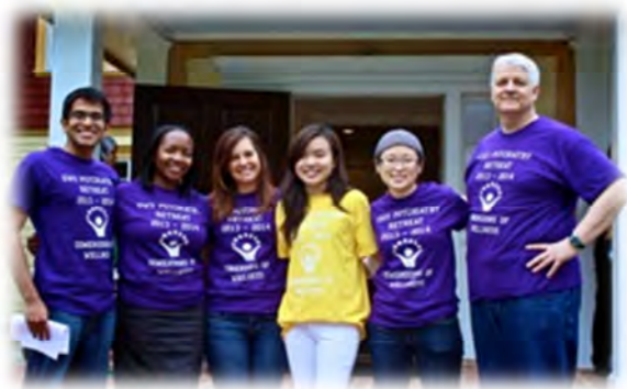
PGY-1s at the Resident Retreat

Past efforts to integrate humanism and neuroscience research in psychiatric training have not dealt adequately with critical epistemological and pedagogical differences between neuroscience research and humanistic psychiatry. Humanistic psychiatry focuses on the mental health of whole persons. It relies upon phenomenology for much of its clinical knowledge, tracking the patterns of a person's first-person lived experience within its contexts of family, community, and culture. Inquiry and dialogue are methods that seek a collaborative understanding of a patient's life that can help the patient to utilize personal agency, problem-solving, and relational support to achieve therapeutic ends. Humanistic psychiatry has been more about "doing with," rather than "doing to" a patient.