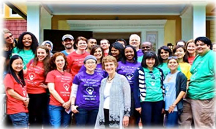
Christina Puchalski, MD

Psychiatric neuroscience research, however, has sought to elucidate the neurobiology of major psychiatric disorders, such as schizophrenia or bipolar disorder. It has largely utilized experience-distant, context-free observations under controlled laboratory conditions in order to describe neural structures and the processing of information within the nervous system. It has sought prediction and control over variables that can attenuate psychiatric symptoms. Pharmacological and other somatic treatments derived from neuroscience research have been more about "doing to" rather than "doing with" a patient.